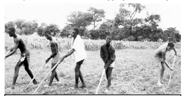
In Bambey, Senegal, the young people of our training center had a slogan they used to chant while working: "joy and songs".

mission "not only as a priority but an extreme urgency for Africa, the training of young people in agricultural development". This was a "turning point" for me! Bro. Gustave, the then-District Superior, suggested that I joined the mission after appropriate training.