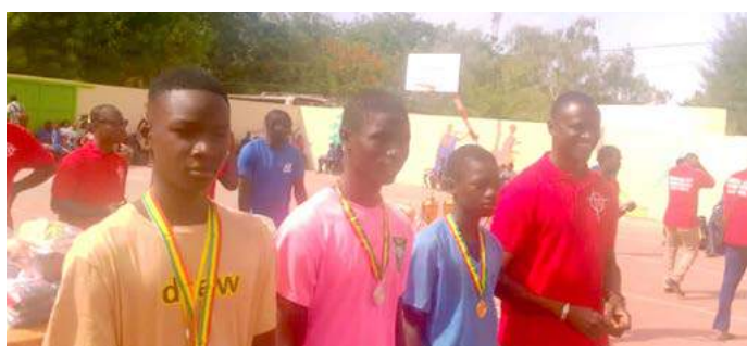
Triple Jump men Winners' Pocitum

Middle School boys competed in football, sprint, and triple jump, while girls faced each other in handball, relay, sprint, and triple jump.