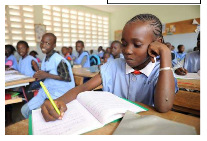
School children in Malika